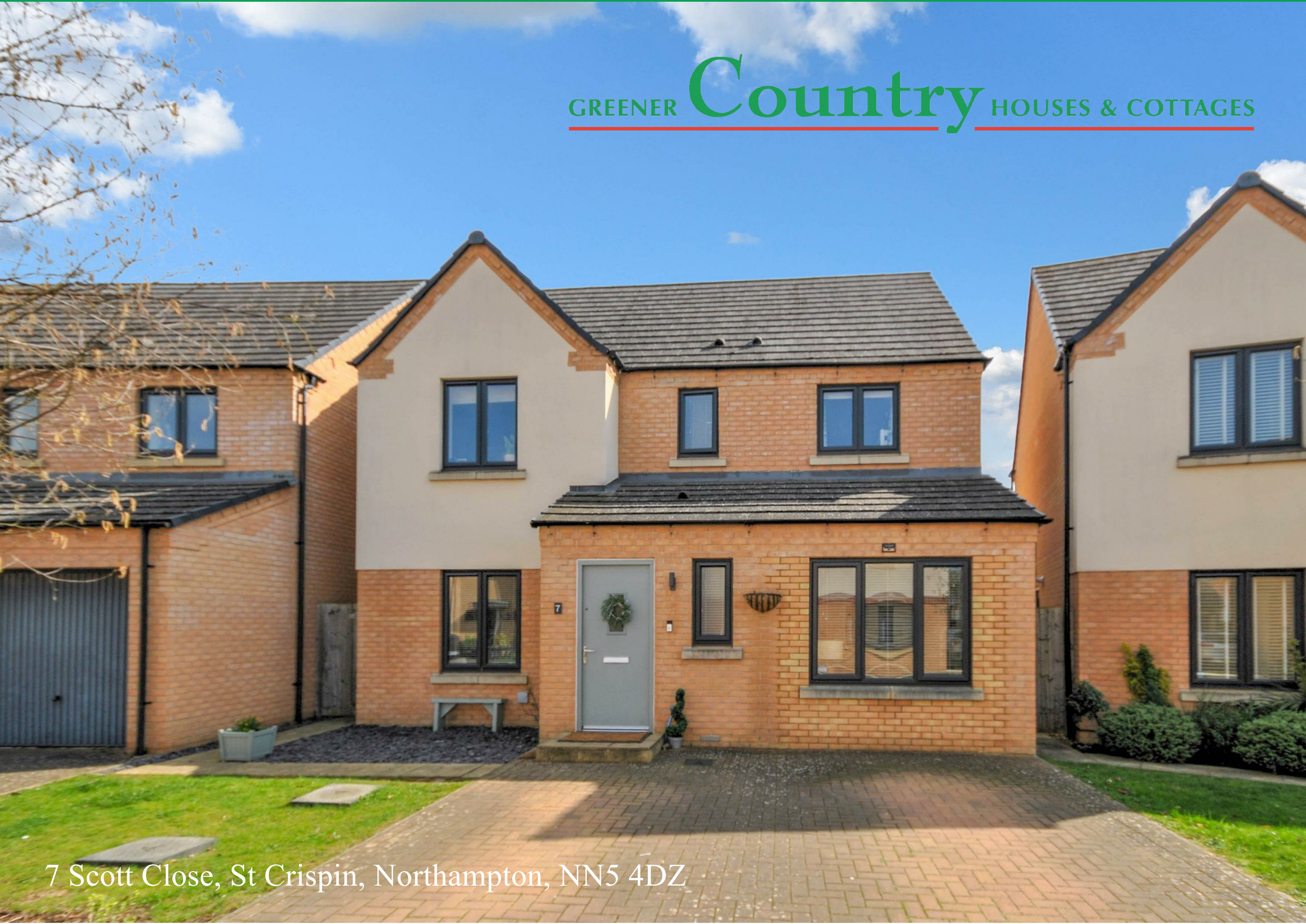
7 Scott Close, St Crispin, Northampton, NN5 4DZ